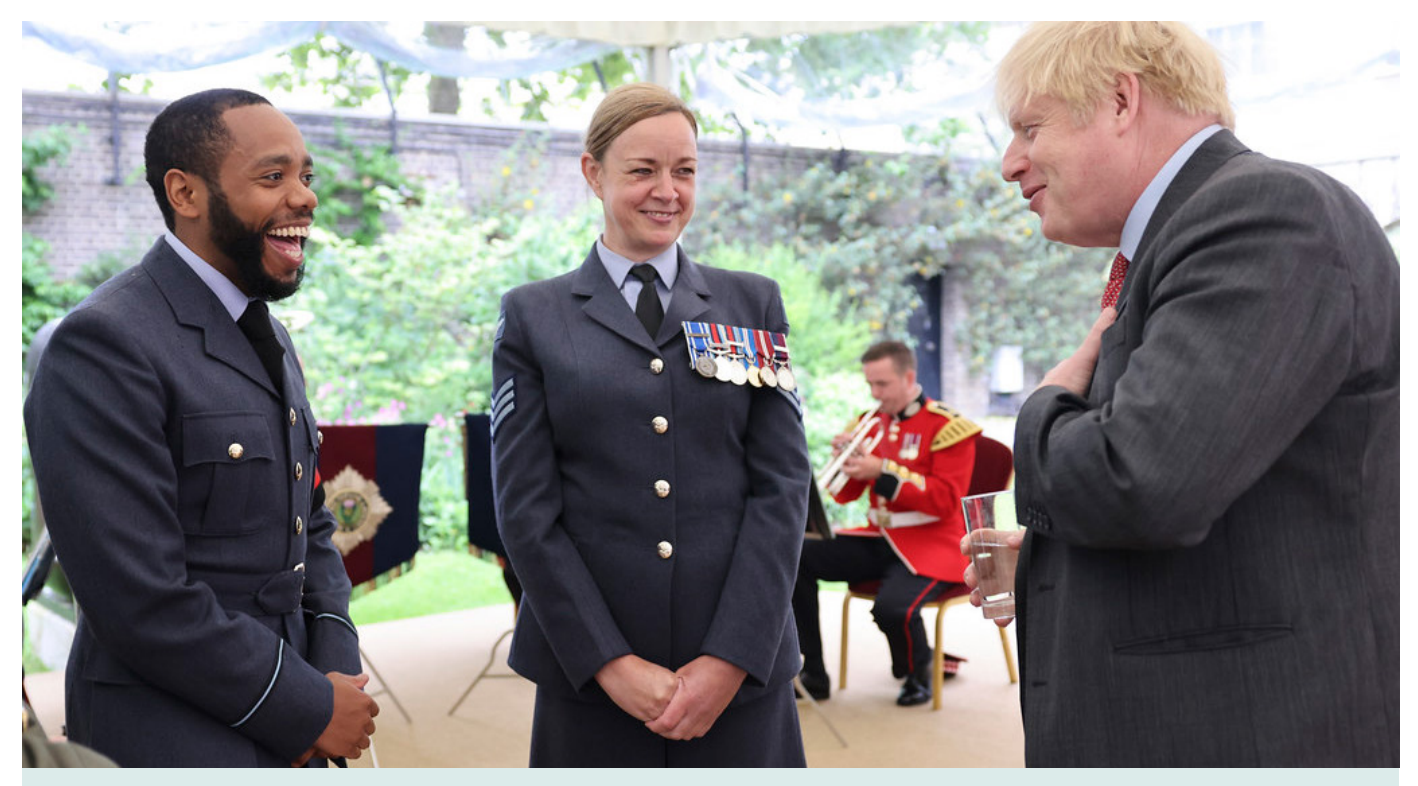
Prime Minister Boris Johnson hosts Armed Forces Day reception

At the end of this Action Plan period in 2024 we will work across sectors to deliver a full refresh of the Strategy, setting out the progress we have made and how we will achieve our 2028 ambition to make the UK the best place in the world to be a veteran.