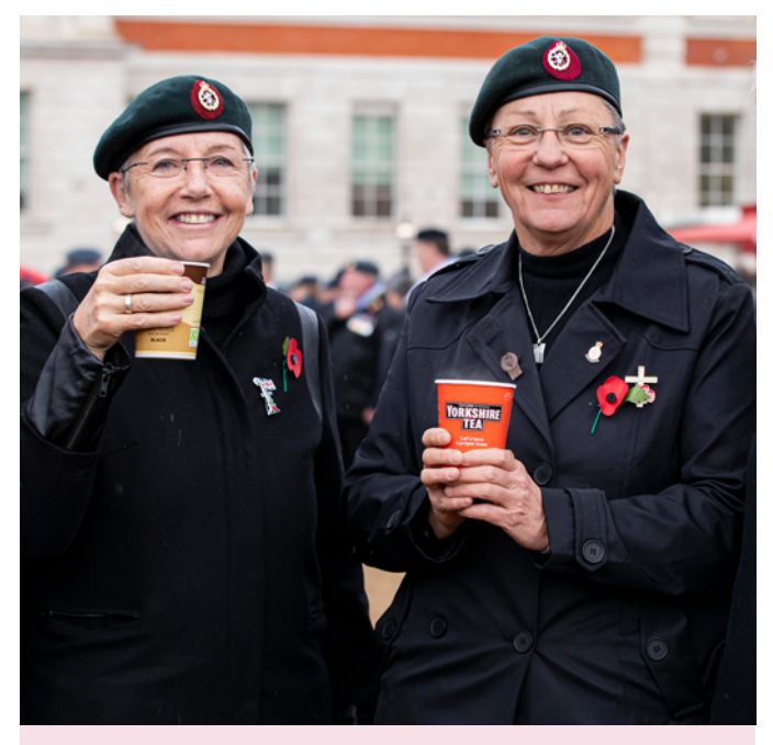
Supporters of Fighting with Pride on Remembrance Sunday 2021. For the first time, LGBT+ veterans had an official role in the service of remembrance at the Cenotaph last year.

Since the publication of the Strategy for Our Veterans in 2018 and the creation of the Office for Veterans' Affairs we have been making an ever increasing effort to highlight examples of veterans supporting their communities, excelling in their new careers and enriching our society. There is still more work to be done and the commitments in this Action Plan will go further in ensuring their contribution to public life is recognised and that the public understands what it means to be a veteran – in particular where they belong to groups who have not previously felt this was the case.