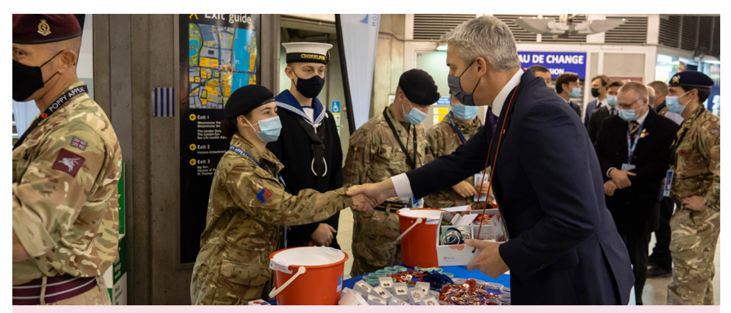
Chancellor of the Duchy of Lancaster Steve Barclay helping sell poppies on London Poppy Day alongside serving personnel from the Armed Forces

For anyone injured in the Troubles and living with permanent disablement as a result, a new scheme – the Troubles Permanent Disablement Scheme – opened in August 2021. Applications for the Troubles Permanent Disablement Scheme can be made online or on paper.