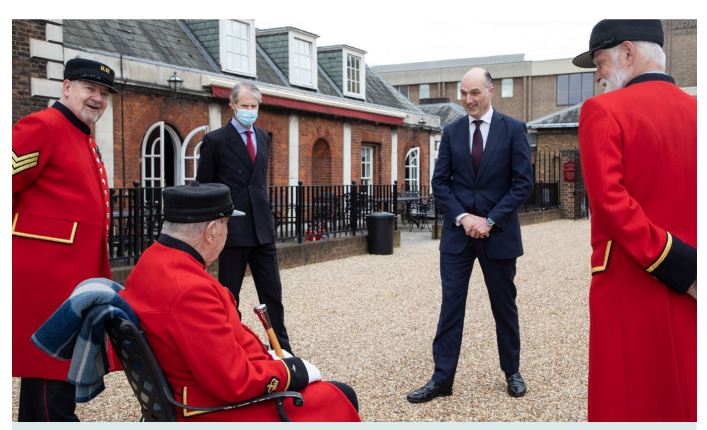
Minister for Defence People and Veterans Leo Docherty meets three Chelsea Pensioners in traditional red uniform at The Royal Hospital Chelsea

In 2024, the government will develop a fuller Veterans Strategy refresh, setting out how far we have come in achieving the policy outcomes set out in the Strategy for our Veterans , and what remains to be done to deliver on our policy ambition by 2028 to make the UK the best place in the world to be a veteran.