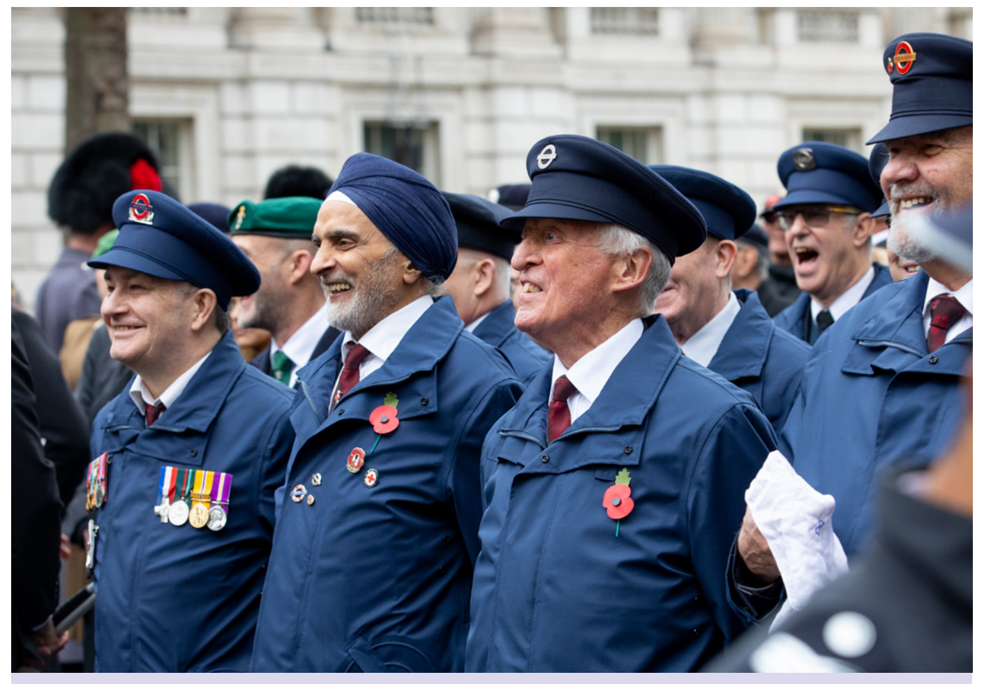
Members of the Transport for London contingent prepare to march past the Cenotaph on Remembrance Sunday